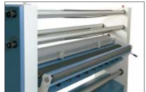
Output slitters, cooling fans, flip-up pull rollers.

Note: SEAL® recommends that your main power be installed by a licensed electrician in accordance with electrical codes in your area. Specifications subject to change without notice. Main power must be wired to specification of model ordered.