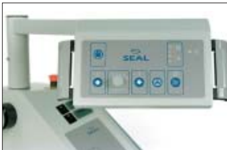
Ergonomic touch pad control panel on a pivot arm.