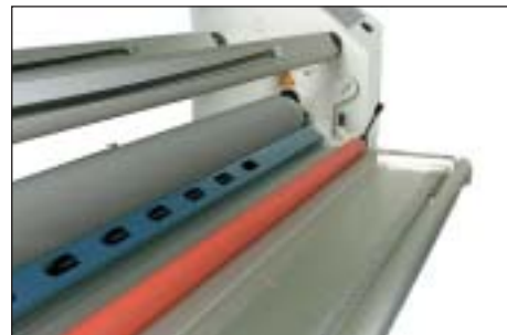
Feed table with built-in tensioning rollers and a flip-down image guide.